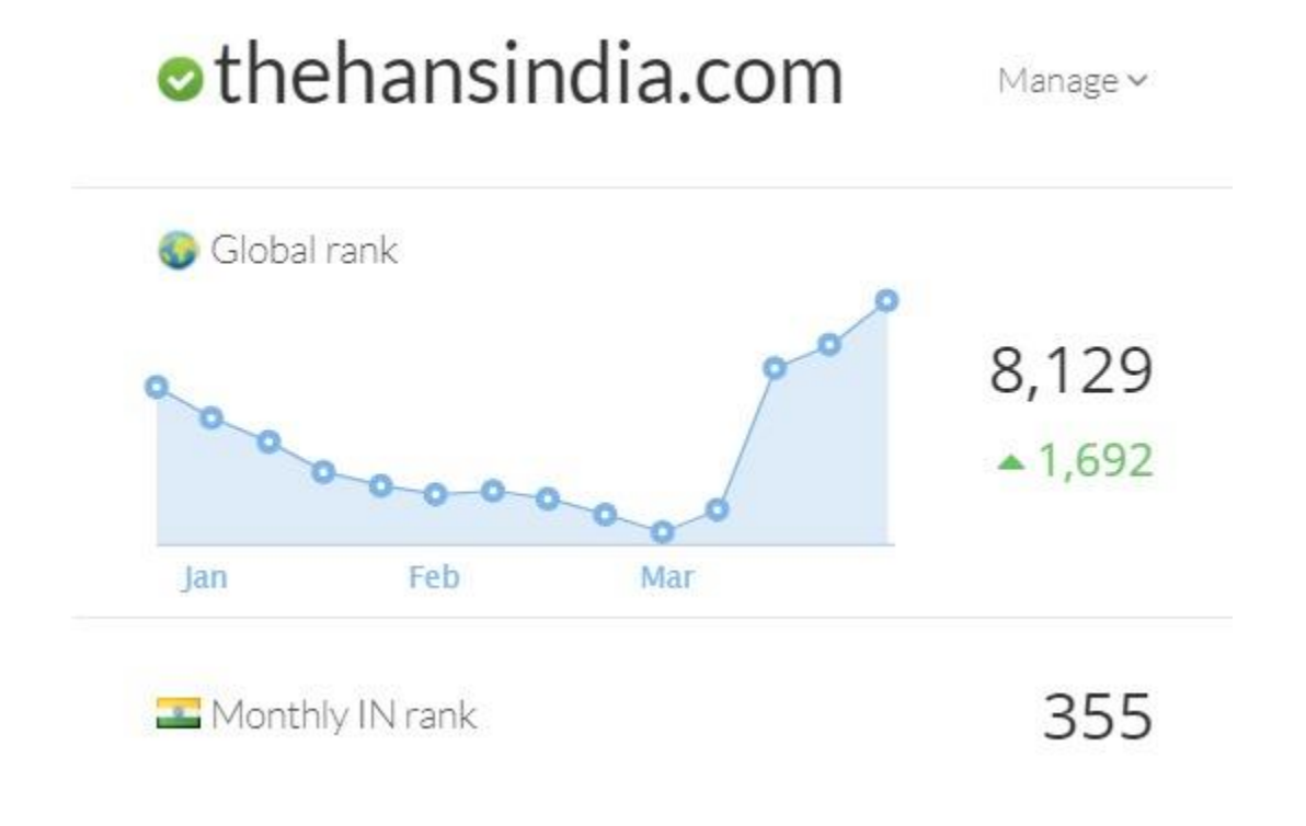
Exhibit 3 Alexa Rank Growth of The Hans India After moving to Hocalwire in March 2019

THE RESULTS: Without changing any content strategy, The Hans India were able increase revenue multifold and gained the ranking exponentially as shown bellow